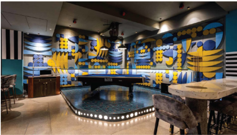
The game/pool area with the sporty dining wall, stools and seating.