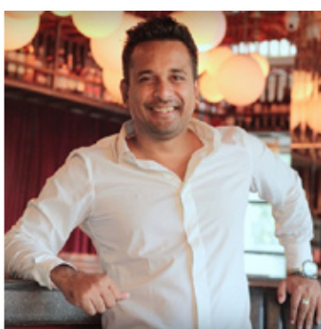
Project - Daddy, Bengaluru