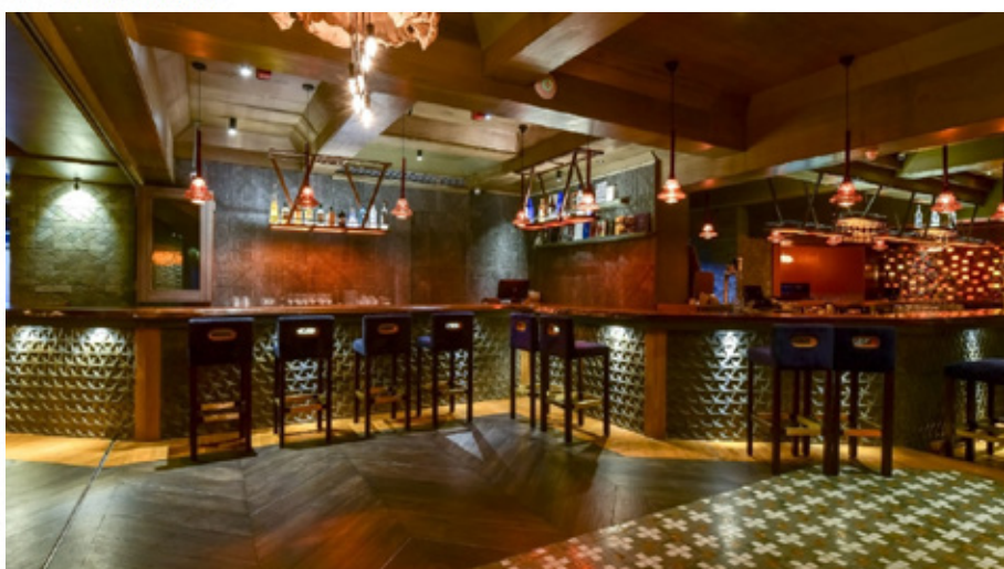
Koko 2.0 in Mumbai. Designed by Sumesh Menon Associates, won the winner for Interior Design - Hospitality & Leisure

PEOPLE / ACES OF SPACE DESIGN AWARDS 2019