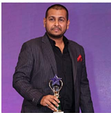
Project - Elite Apartment, Mumbai

Considering the space constraints in Mumbai, the toilet was converted into a plush powder room. With smart sense of design, the use of dark colours enhance the aesthetics of a rather tiny space. Carefully handcrafted organic fixtures and wall art are used alongside the black marble cladding, which strikes a fine balance with the subtle champagne gold textured ceiling.